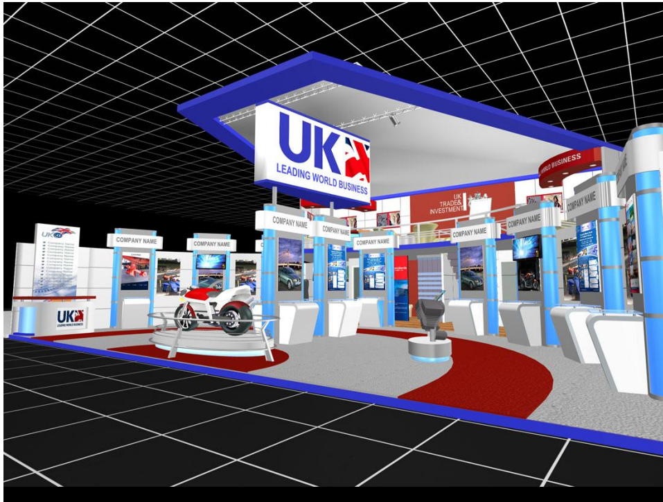
2010 UK Stand - AutoExpo

AutoExpo is the largest automotive show in Asia and attracts over 1 million visitors with over 100,000 business visitors. It offers unique access to the Indian market and the 2010 event will also include a wide range of other support events to help the UK delegation get connected with the key players in the Indian market.